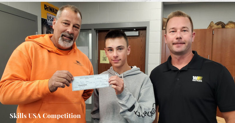
Skills USA Competition