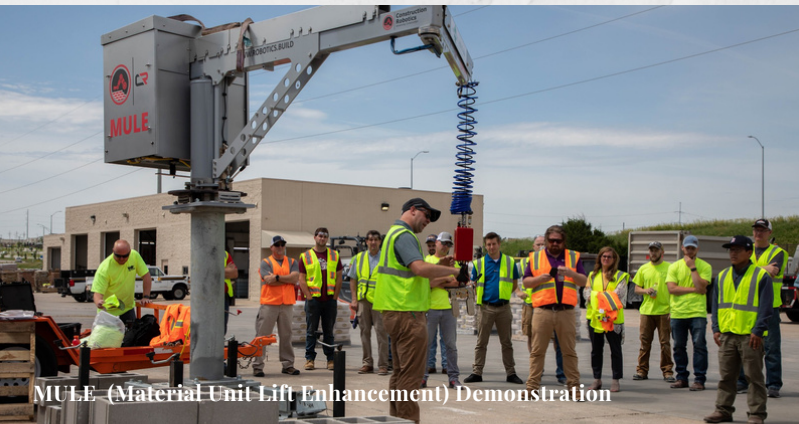
MULE (Material Unit Lift Enhancement) Demonstration